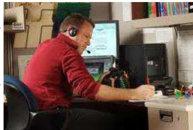
New Age Teacher